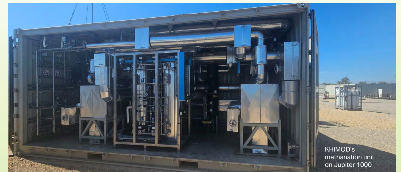
KHIMOD's methanation unit on Jupiter 1000